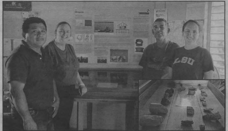
Opening of permanent exhibit in the Tourism Information Building in Punta Gorda, Belize featuring 3D replicas of artifacts and wooden posts from the Underwater Maya project. Time release photo courtesy H McKillop

In March 2012, with funding from a "Site Preservation Grant" from the Archaeological Institute of America, we opened two permanent exhibits, including one in Punta Gorda and another in remote Paynes Creek National Park, accessible only by boat. The exhibits